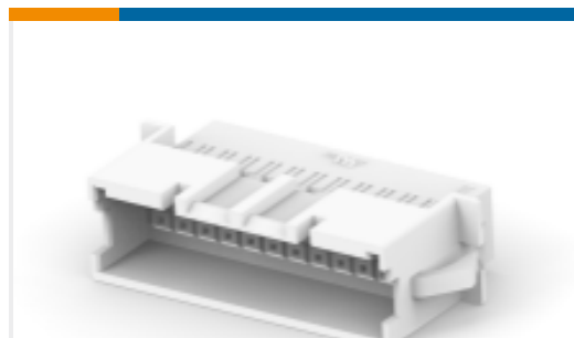
TE Part # 2-2323745-4 HSG,REC,PANEL MOUNT,GWT, DUALROW,EP2.5